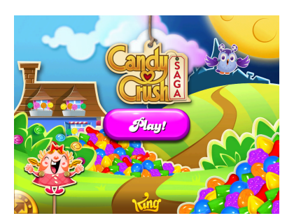
Figure 2. Snapshot of Candy Crush's starting UI

Figure 2 presents the first UI to which users need to respond by clicking the "Play!" button. Although such testing behaviors look naïve to humans, they seem not well supported by Monkey testing. Two possible reasons can explain such insufficiency. First, Monkey cannot read dialogs, neither can it smartly make decisions or enter necessary information to proceed in the game. Second, Monkey does not know the game rules. It does not recognize candies, so it cannot move mouse around to drag-and-drop candies. Consequently, Monkey cannot play the game for testing.